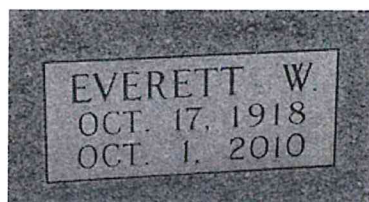
Added by RWCNAC